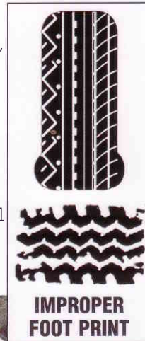
IMPROPER FOOT PRINT