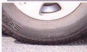
BEFORE AND AFTER ILLUSTRATIONS SHOWING THE ADVANTAGE OF ROADMASTER ACTIVE SUSPENSION

WITH RAS Decreased roll resistance for improved fuel efficiency